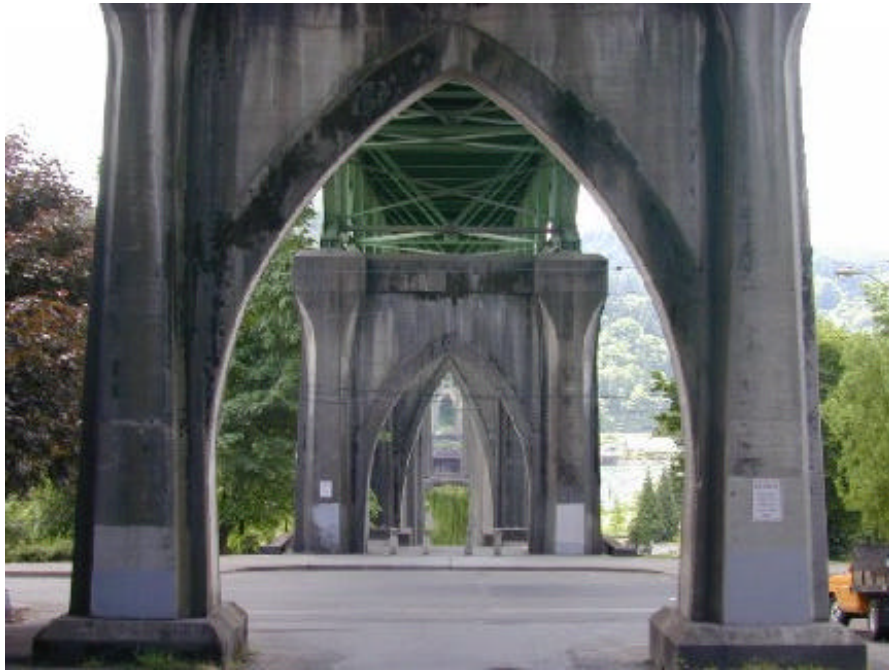
Under St. Johns Bridge is the entrance to the aptly named Cathedral Park

what went up has to come down sooner later. Saturday we went up Germantown Rd, on this day we would go down. I love the smell of hot brakes in the afternoon. Across St. Johns bridge again and back to the hotel for cool adult beverages and the usual stories of getting lost, missing checkpoints, and comparing answers to all the questions.