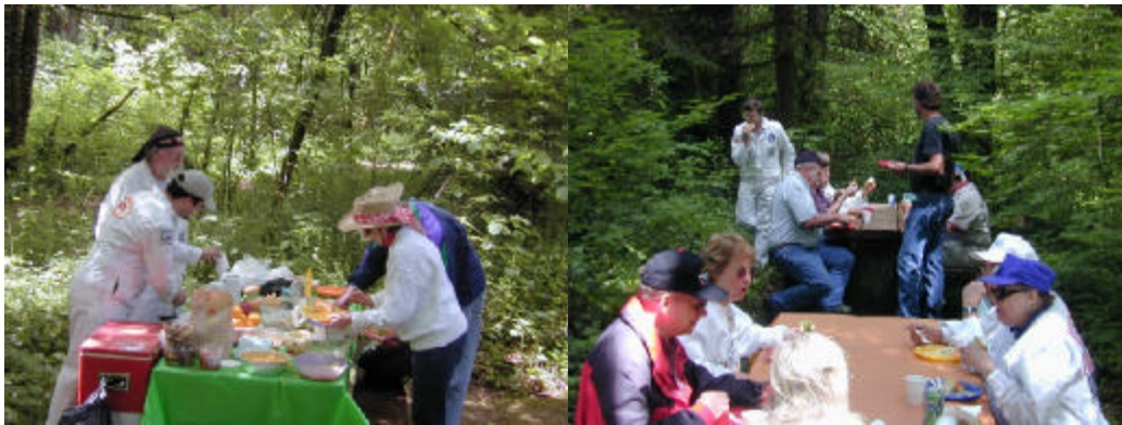
On the “U-Park-It” lunch was served, where else, in a Park.

many antique shops. Here we also enjoyed welcome relief of coffee, juice and sweet choices that stuffed the cockpits even further. We continued south paralleling the Willamette River's East Side as far south as the Clackamas River. At the confluence of the Willamette and Clackamas River navigators had to learn what to do in case of an earthquake in Clackamette Park. You guessed it...RUN !! It was also here that we reached the southern most point of the route in Oregon City. Crossing the Willamette River again and north along the West Side of the great river to Mary S. Young park for lunch.