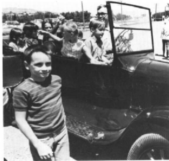
In addition to entering the race, members of the Livingston Model T Ford Club donated their time and cars to give the kids a chance to see (and feel) how it was in great-granddad's time.