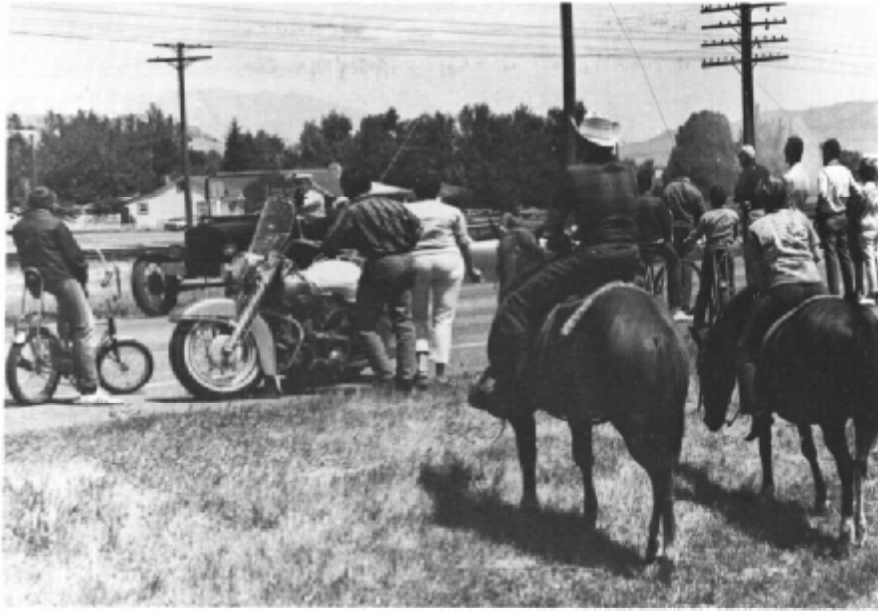
A spectator sport, too. Bring your own scats!

Almost everyone has heard of the great Montana Cross Country Model T Race, which is held in June of each year. That event lasts for several days and covers hundreds of miles.