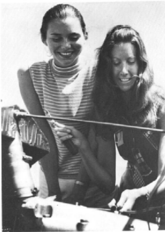
Skilled mechanics make final adjustments. Reports are that this car hasn't run right since, but with mechanics like these, who cares!