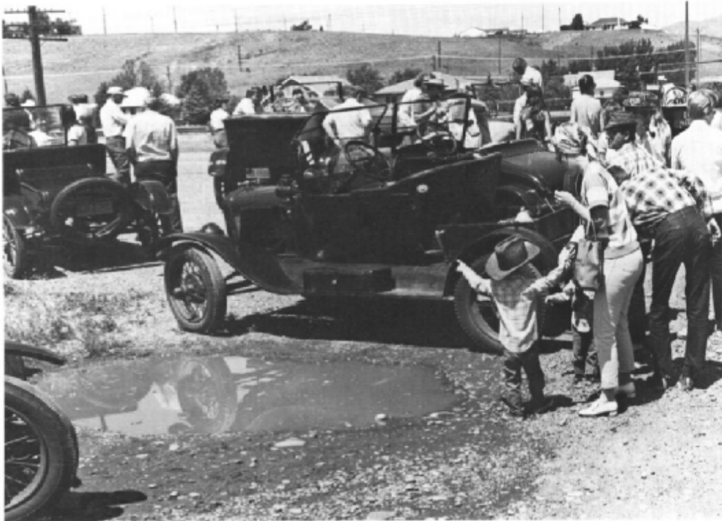
Participants, spectators and cars mingle prior to the race. If it gets too hot you can always take a dip in the pool in the foreground.